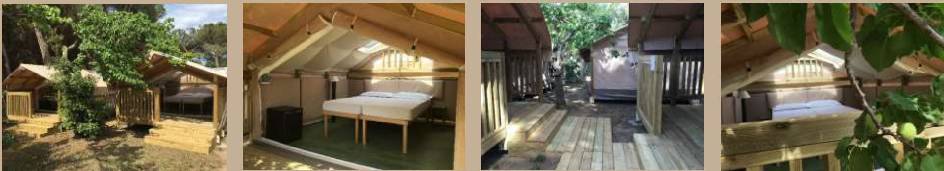
THE OMIN GATE

The Mini DOUBLE Lodge Tent is composed of two connecting Mini Lodge Tents. Sleeping max. 4 people.