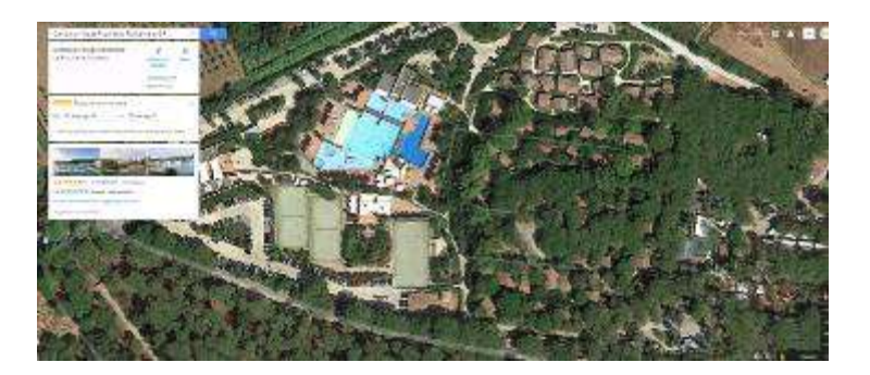
CAMPING VILLAGE ROCCHETTE - VIRTUAL TOUR: <u>http://www.rocchette.com/virtual-tour_it.html</u>